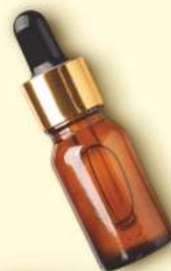
OXY DE-TAN PACK