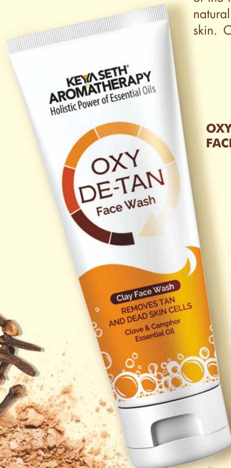
OXY DE-TAN FACEWASH

Aromatherapy & Essential Oil are the best choices to remove instant suntan. Getting tanned is one of the most common skin problems in summer. Our De-tan pack & Facewash has developed a natural formulation with essential oils for removing skin tan, maintaining skin pH & nourishing the skin. Oxy De-tan range is the best choice to remove instant suntan.